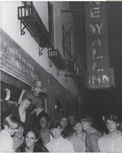
Participants of the Stonewall Uprising in front of the bar, June 29, 1969.

The LGBT community historically suffered harassment, discrimination, and oppression from their families, organized religion, psychiatric professionals, and government. After Prohibition the New York State Liquor Authority (SLA) in 1934 was granted the power to revoke the license of bar owners who "permit [their] premises to become disorderly" and the mere presence of gay people was considered disorderly. LGBT people could not touch, dance together, make direct eye contact, or wear clothes of the opposite gender without fearing arrest. For women, people of color,