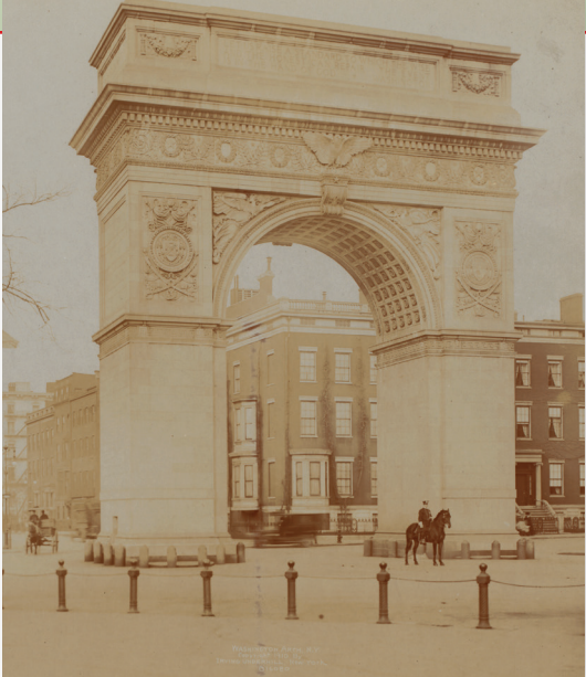
Washington Square Arch c. 1900.

The 1969 Stonewall Uprising was a key turning point in the history of the LGBT civil rights movement in the U.S. The uprising dramatically changed the nearly two-decade-old movement by inspiring LGBT people throughout the country to assertively organize on a broader scale. In the years that followed, hundreds of new organizations were formed on campuses and in cities across the country as a younger generation of activists came out of the closet and demanded full and equal rights. As historian Lillian Faderman wrote, Stonewall was "the shot heard round the world...crucial because it sounded the rally for the movement."