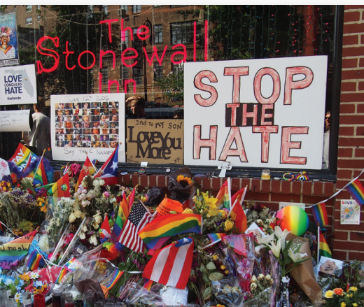
Pulse nightclub shooting memorial in front of the Stonewall Inn, a day after Stonewall's National Monument designation.

Court in 2013, and after the Supreme Court legalized same-sex marriage nationally in 2015. People commemorated here the victims of the 2016 mass shooting at Pulse, a gay nightclub in Orlando, Florida.