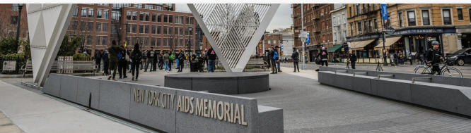
The NYC AIDS Memorial.

Since the early 20th century, this neighborhood has been home to many LGBT people, establishments, and organizations, and is closely associated with the AIDS epidemic. By the 1980s, Greenwich Village was the epicenter of the disease in the city. Since 1983, New York's LGBT Community Center (208 West 13th Street) has served hundreds of thousands of people – this is where ACT UP (AIDS Coalition to Unleash Power) and other groups were organized and met. The former St. Vincent's Hospital had the first and largest AIDS ward on the East Coast. The New York City AIDS Memorial, at the intersection of 7th and Greenwich Avenues and 12th Street, honors the more than 100,000 New Yorkers who have died of AIDS and recognizes the contributions of caregivers and activists.